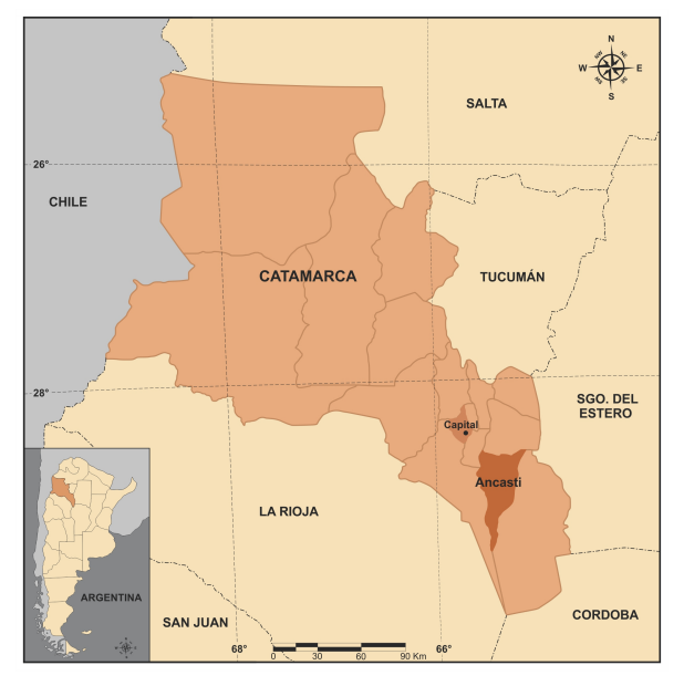
Figure 1. Study area, Ancasti district, Catamarca Province, Argentina.

Characterized by mountainous relief, the region features high meadows with natural pastures, streams and small intermontane valleys and mountainsides with woody formations. The vegetation in the area is a mixture of arboreal elements typical of the semi-arid Chaco, such as Geoffroea decorticans (Gillies ex Hook. & Arn) Burkart., Jodina rhombifolia (Hook. & Arn.), Reissek and Schinopsis lorentzii (Griseb.) Engl, with