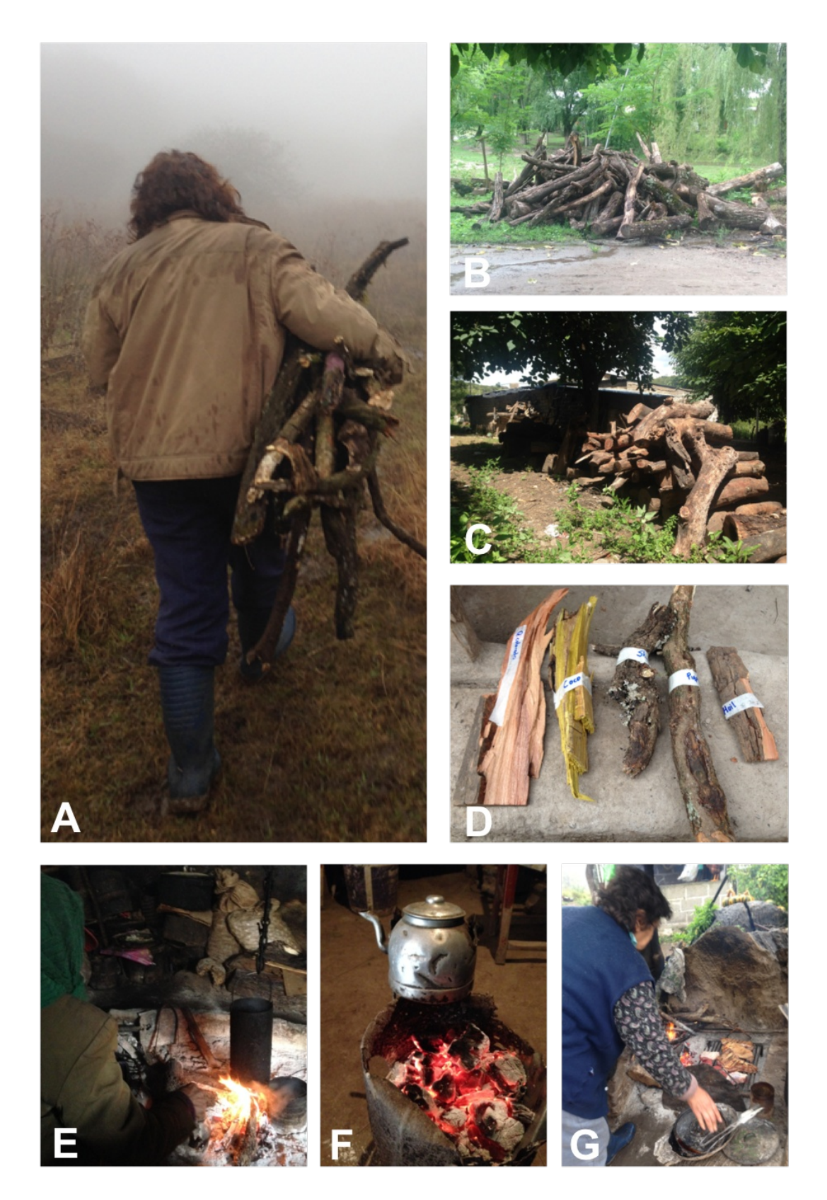
Figure 2. Firewood for the criollos of Sierra de Ancasti, Catamarca, Argentina. A: collection. B, C: stacks of firewood (B: Salix humboldtiana , C: Shinopsis lorentzii ). D: diversity. E, F, G: applications and uses (food preparation).