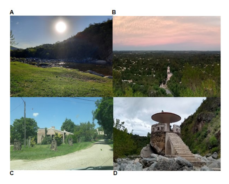
Figura 2. Landscapes of the Paravachasca valley: A) Anisacate River in the municipal resort of La Serranita; B) View of Villa La Bolsa, showing the Anisacate River in the middle; C) Construction and street in Villa Los Aromos; D) "El Hongo" (the mushroom), monument located in Villa La Paisanita.)

these houses. Figure 2 shows some of the landscapes of the Paravachasca Valley, in order to illustrate the context of our study.