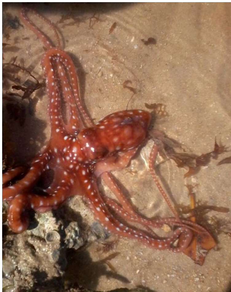
Figure 1. Callistoctopus sp. specimen found in a coastal reef of Porto Seguro (BA). First record of its occurrence in Bahia. Photo: Edmilson Conceição (JESUS et al., 2015).