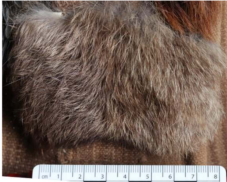
Add File 24. Piece of fur from an unidentified mammal attached to the hood.

The hood contains a patch of thick fur, approximately 10 x 6 cm, with a grey brown-colour and woolly appearance. Considering the size and the thickness of the fur it probably belongs to a mammal that is larger than a squirrel. This patch does not contain any other morphological features that allow for a more accurate identification. A possible candidate is a crab-eating raccoon ( Procyon cancrivorus ), as it has a similar fur colour, a wide distribution and commonly occurs along watersides.