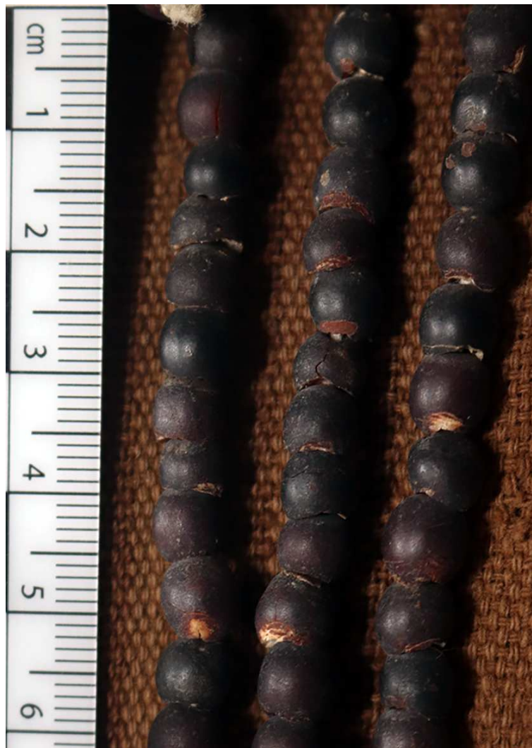
Add File 1. Strings with seeds of Canna indica L.

Cannaceae, Canna spp. Asháninka name: Antsíriki (for Canna indica , according to Weiss 2005, 55)