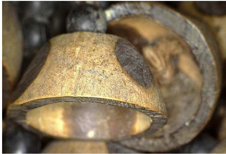
Add File 4. Detail of modified seed of Astrocaryum cf. perangustatum

Areaceae, Astrocaryum cf. perangustatum F.Kahn & B.Millán. Asháninka name: Tiroti (Sosnowska et al. 2015: 456)