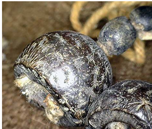
Add File 8. Seeds of Aiphanes horrida

Areaceae, Aiphanes horrida (Jacq.) Burret. Asháninka name: Panataroki (Sosnowska et al. 2015: 460)