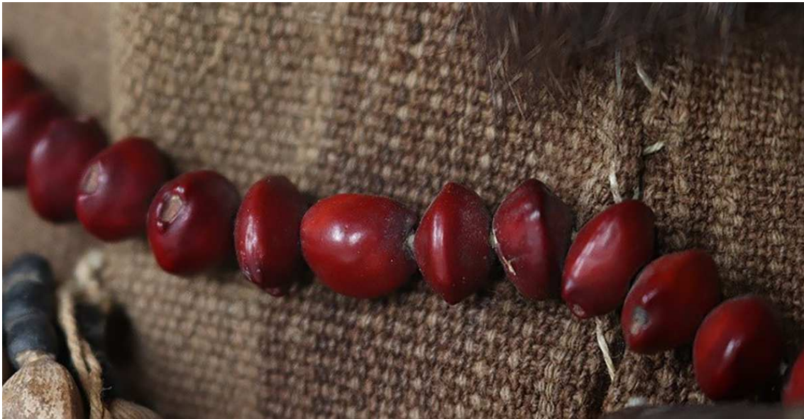
Add File 6. String with perforated seeds of Adenanthera pavonina L.

Leguminosae, Adenanthera pavonina L. Local name unknown.