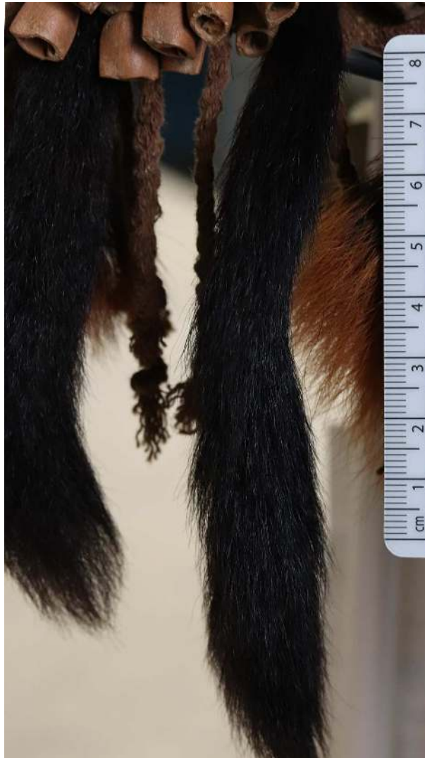
Add File 22. Tails of an unidentified monkey hanging from the bottom of the hood.

The hood contains 13 black tails with lengths between 10cm and 15cm. Considering the length and the diameter of these tails they probably belong to a primate. Potential candidates with long, black, non-prehensile tails that occur in the Peruvian Amazon are the saddleback tamarin ( Saguinus fuscicollis ), several species of moustached tamarins ( Saguinus spp.) or night monkeys ( Aotus spp). Taxonomists disagree about the number of subspecies in both genera, as there is variation in fur colour (Emmons 1997).