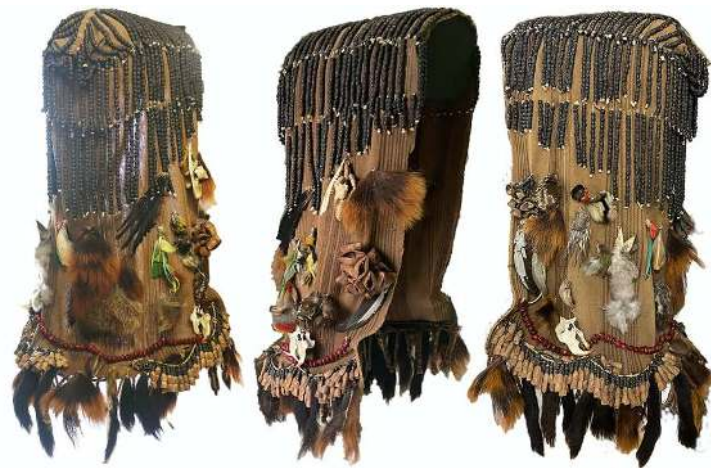
Figure 2. The Asháninka shaman hood (Wereldmuseum collection nr. TM-5074-2), with the back- and right side (left), front opening and right side (middle) and left side (right).