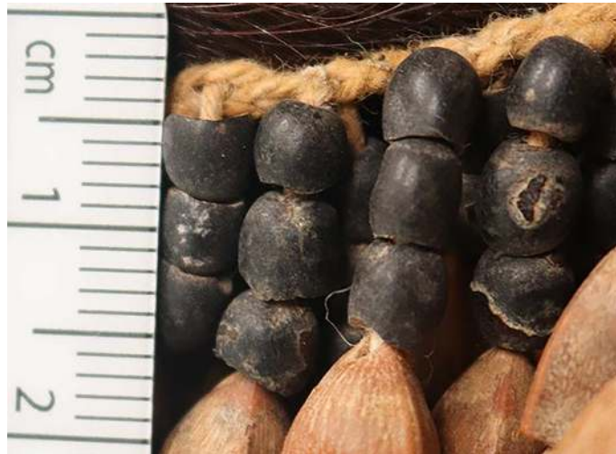
Add File 2. Strings with seeds of Canna cf. paniculata Ruiz Pav.

Cannaceae, Canna cf. paniculata Ruiz & Pav. Local name unknown.