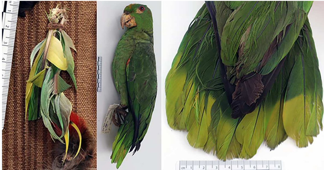
Add File 15. Tail feathers of and Amazon parrot, attached to the hood (left). Amazona ochrocephala (middle) and A. farinosa (right) in the Naturalis collection.