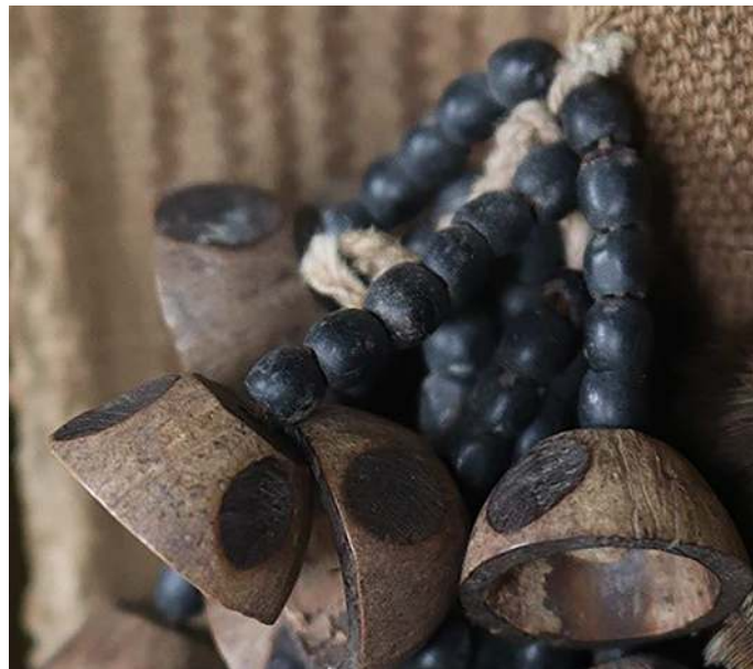
Add File 3. Seeds of Canna cf. jaegeriana Urb. and Astrocaryum attached to short strings.

Cannaceae, Canna cf. jaegeriana Urb. Local name unknown.