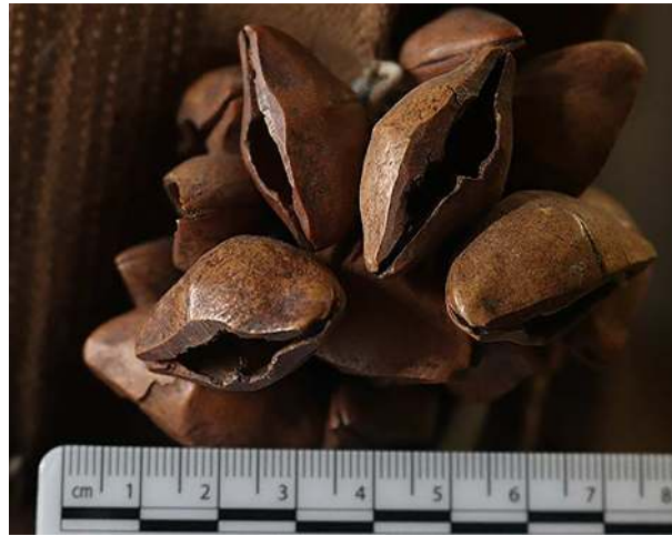
Add File 7. Endocarps of Cascabella thevetia (L.) Lippold

Apocynaceae, Cascabella thevetia (L.) Lippold. Asháninka name: Tánoki (Weiss 2005: 55)