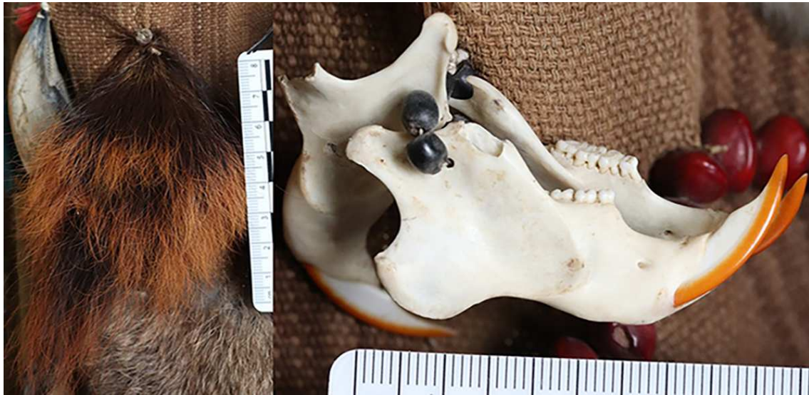
Add File 19. Squirrel tail (left) and jawbone (right) attached to the hood.