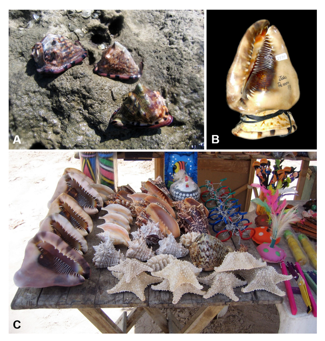
Figure 5. (A) Live specimens of Cassis tuberosa caught by fishermen on the coastal reef of Cabo Branco beach, João Pessoa, state of Paraíba, Brazil. (B) Table lamp made with two shells of C. tuberosa . (C) Shells of C. tuberosa for sale in a beach tent in Coqueirinho beach, Conde, State of Paraíba, Brazil (Photos: Thelma Dias).

The king helmet, Cassis tuberosa , is part of a specialized group of large mesopredatory gastropods that inhabit the shallow waters of the Gulf of Mexico and the