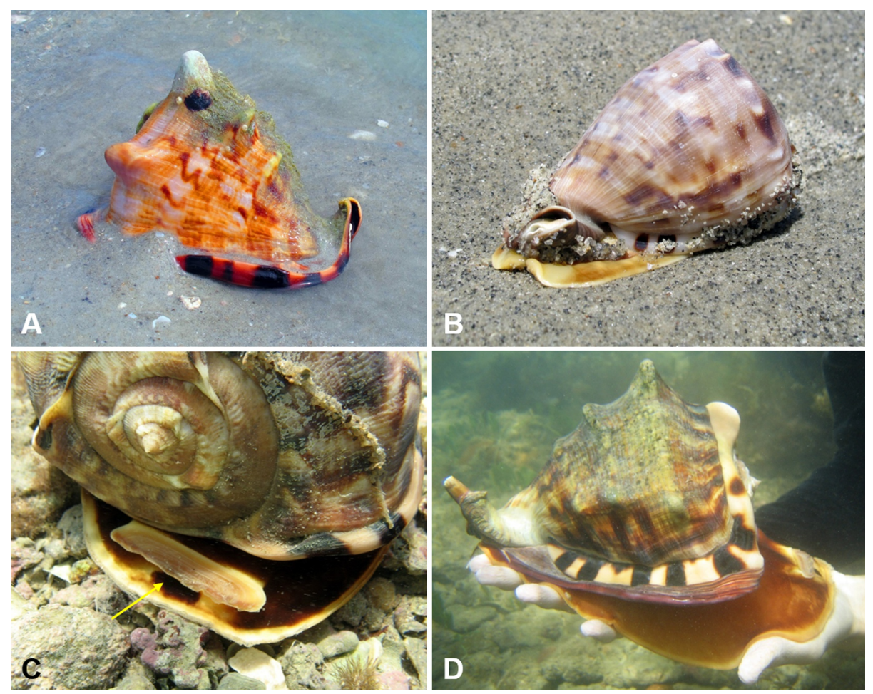
Figure 2. (A) Adult individual emerges on a sandy beach during low tide and (B) Young moving on sandy bottom at Macau, state of Rio Grande do Norte, NE Brazil. (C) View of the back of Cassis tuberosa with detail on the reduced operculum (yellow arrow) and (D) Adult with wide distended foot at Cabo Branco reefs, João Pessoa, state of Paraíba, NE Brazil.

In the soft part, the ample ventral muscular foot constitutes a great part of the visceral mass (Figure 2d). Although the siphonal canal is short, the siphon of large caliber can extend to reach the dorsal side of the shell, as reported by Hughes and Hughes (1971). According to these authors, the taenioglossate radula of Cassis tuberosa is reinforced with seven strong teeth per row, with a central spinal tooth and heavily spit lateral teeth. Details of the morphology of the digestive tract are shown by Hughes and Hughes (1981).