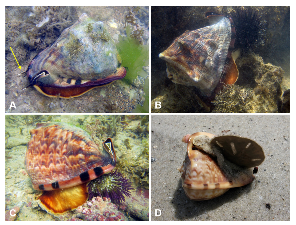
Figure 4. Predatory behavior of Cassis tuberosa. (A) Adult searching for prey with tentacles extended forward (yellow arrow) and (B) Adult preying on sea urchin Echinometra lucunter in reef environment at Cabo Branco beach, João Pessoa, state of Paraíba, Brazil. (C) Adult preying on sea urchin Lytechinus variegatus in a patch reef at Praia Formosa, Cabedelo, state of Paraíba, Brazil. (D) Young preying on the sand dollar Mellita quinquiesperforata on sandy beach at Macau, state of Rio Grande do Norte, Brazil (Photos: Thelma Dias).

Once the prey is detected, C. tuberosa raises the front portion of the foot and guickly expands it over the animal, holding it firmly. The proboscis is then extended and the small head rests on the foot (Hughes and Hughes 1971). When the echinoid prey is a sea urchin, after subjugating it, the predator uses the anterior portion of the muscular foot to break the spines of a small test area where it drills a small hole (about 0.5 cm in diameter) to access soft tissues of prey (Hughes and Hughes 1971, 1981). Figure 4 illustrates different stages of the