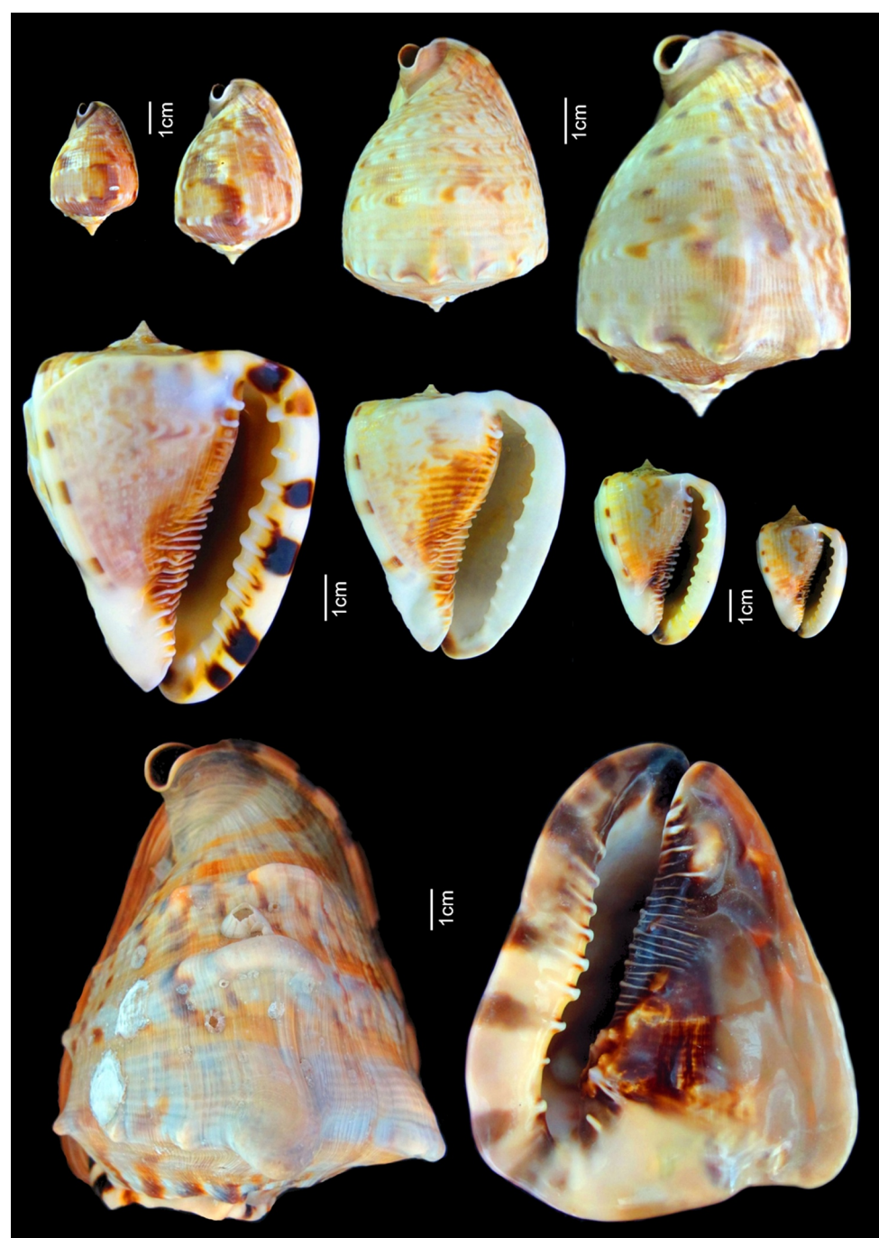
Figure 1. Cassis tuberosa growth series illustrating shell characteristics from the young phase to the adult phase (Photos: Thelma Dias).

This short review presents the main information available in the literature published in scientific journals, books and book chapters that address this species. The literature used was searched in Google Scholar and on journal websites. Some full papers published in the Proceedings of Scientific Events were also included.