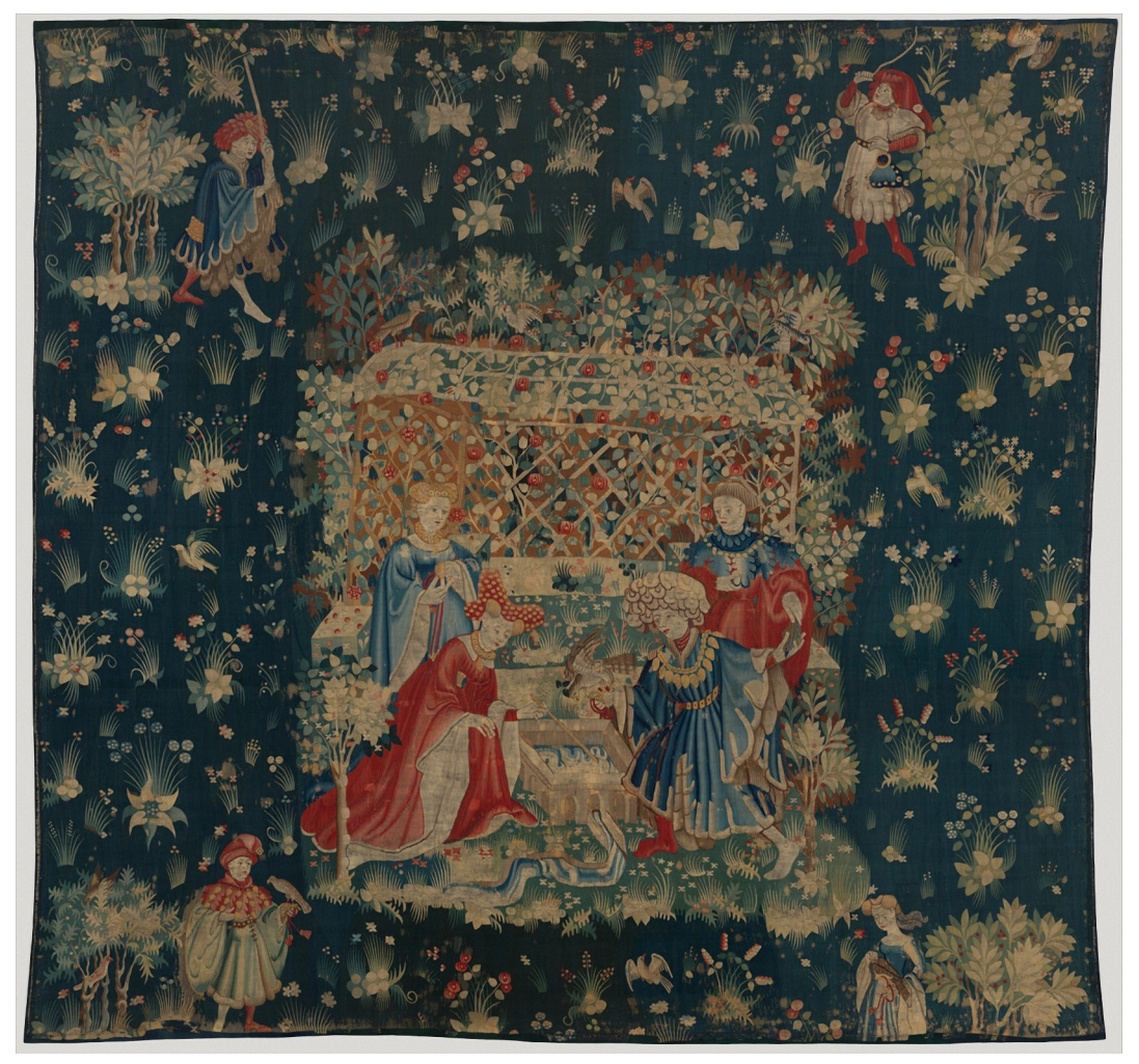
Figure 2. "The bath of the Hawk". Tapestry dated 14001415 showing the preparation of the hawk with a bath in order to make him more docile. These animals were subsequently used for hunting other animals. Public domain image.

Land conquests brought animals from different parts of the world to Europe. When Luiz IX of France returned from the Crusade, he brought with him several elephants (Kisling 2001; Osborne 1994). The Vatican collections began to grow with Pope Benedict XII (1285 1342); another religious entity, Pope Leo X (1475 1521), also kept various animals, such as birds, lions and leopards, owned by the church. In England, (1199 1216) King John opened approximately 800 parks, containing various species of plants and animals (Rees 2011).