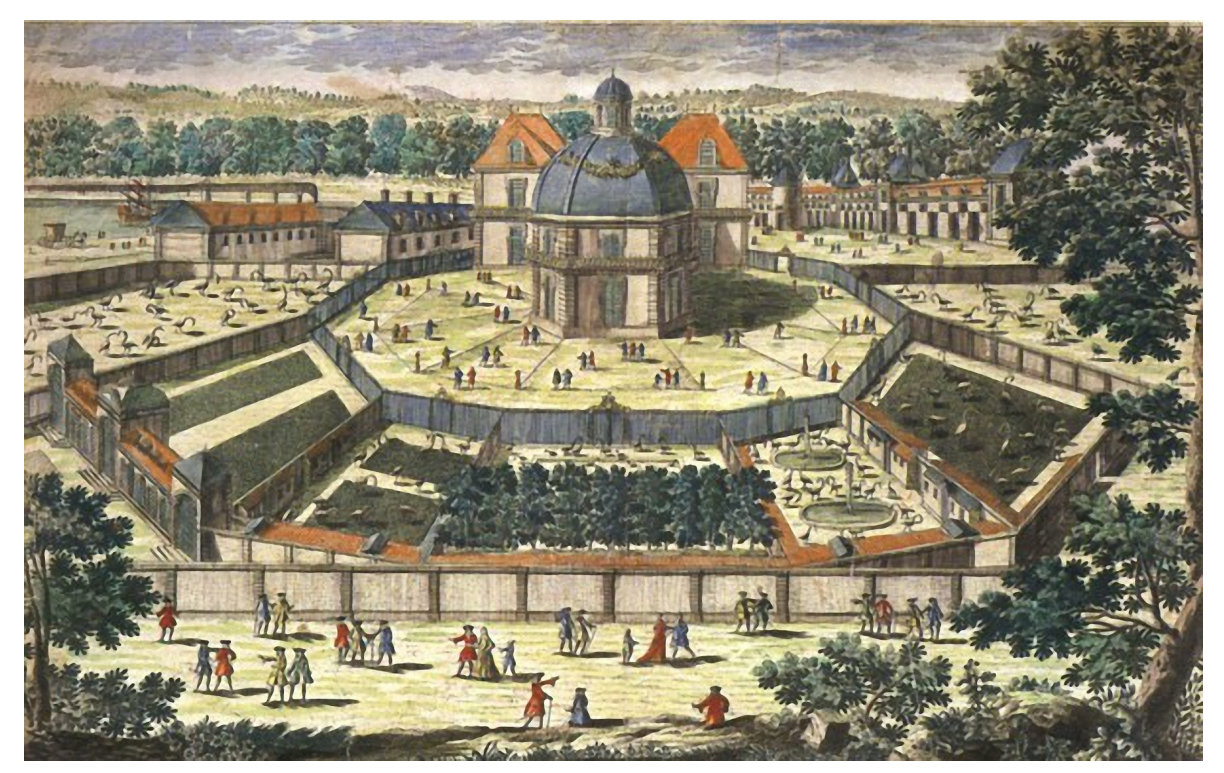
Figure 4. Menagerie built in the Versailles Palace under the kingdom of Luis XIV, 16431715. As we can see, animals were kept in walled enclosures, each of which contained animals belonging to the same species or family, a typical characteristic of the menageries. Public domain image.

During the colonial period, European countries had guite an influence on other civilizations in Asia, Africa and also the New World. In his report on the colonization of Africa. Crosby (1986) endorsed this statement by reporting that there had been a creation of "New Europes". Preponderantly, European settlers imposed their culture, life habits and even their way of relating to natural resources on the colonized peoples (Osborne 1994; Segawa 1993). Since then, many of these areas have been subject to extensive exploitation of plant and animal resources to meet the needs of the settlers (Crosby 1986). In addition, several animals that were abandoned in the colonies or that