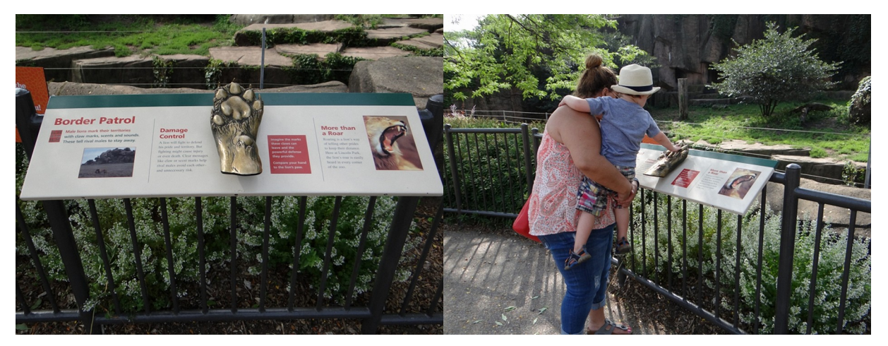
Figure 7. Interaction of visitors in the educational structure installed in the Lincoln Park Zoo (Chicago, USA).

Hoage and Deiss (1996) listed 33 zoological gardens opened in the XIX century, including the abovementioned Jardin des Plantes, opened in the late XVIII century, in most of which the objective of