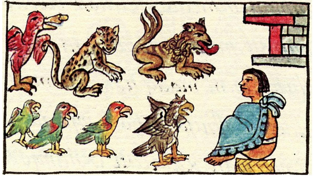
Figure 3. Representation of the legendary Moctezuma Zoo. The image shows the animals of the ruler with one of the 600 animal caretakers. Public domain image.

It was in the Renaissance, when Europe emerged as nationstates and with the increase of power and wealth, that animal collections grew in terms of size and number of species (Grigson 2016; Loisel 1912). Until then there was no specific designation for the confinement of animals. Upon ascending the throne of Versailles in 1661, the absolutist Louis XIV, seeking to expand the gardens of his palace, established the first