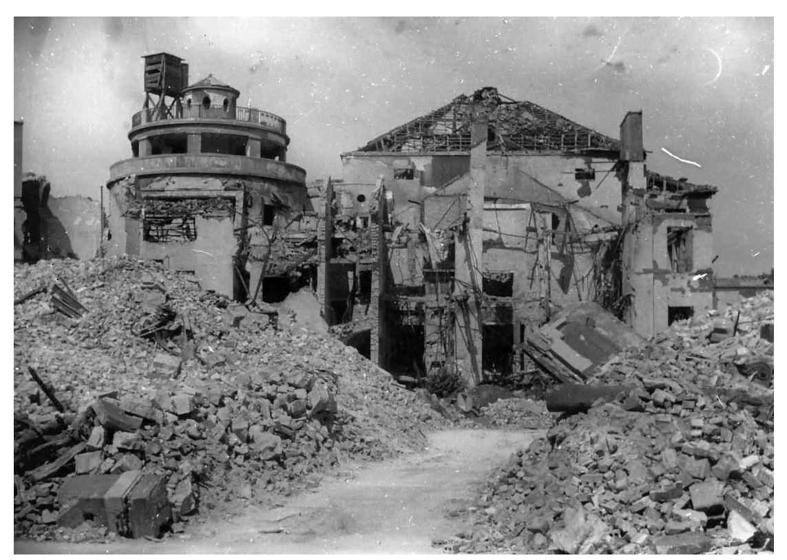
Figure 6. Ruins probably from Berlin Zoo Aquarium after bombing during World War II. Public domain image.

postwar period was marked by efforts for economic development, but investing in the reconstruction of zoos also contributed to the perception that countries were growing (Robinson 1992). The reestablishment of between nations alliances the was necessary for this economic reconstruction. The practice of giving animals as diplomatic gifts can also be observed in the postwar period. According to Lawrence (2012), some animals, such as platypus, served as diplomatic gifts for the reestablishment of dialogue between Great Britain and Australia.