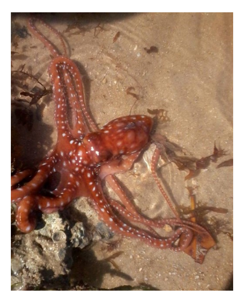
Figure 1. Callistoctopus sp. specimen found in a coastal reef of Porto Seguro (BA). First record of its occurrence in Bahia. Photo: Edmilson Conceição (JESUS et al., 2015).

Table 1. Model of the questionnaire sent to diving schools, addressing specific information about the possibility of encounters between the divers and the target species during underwater activities.