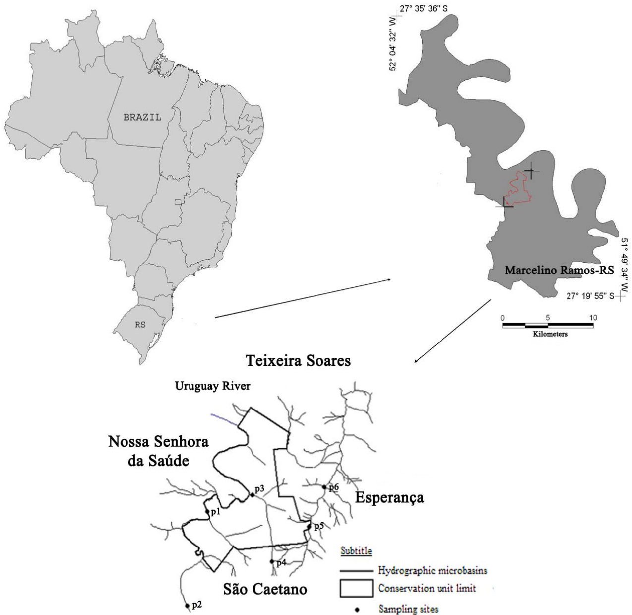
Figure 1. Localization and distribution of sampling sites and surrounding communities for the current study of the Mata do Rio Uruguai Teixeira Soares Municipal Natural Park (PTS).

to the detriment of local and regional urban centers (Socioambiental 2001). The research was conducted in march and october 2009 and, involved two stages. The first stage was to analyze the LEK of the communities surrounding the PTS, whereas the second was to evaluate the water quality within and outside the PTS.