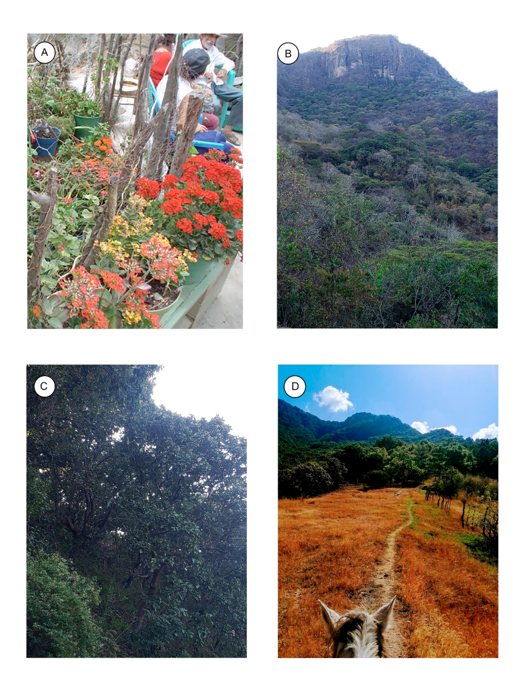
Figure 2. Socioecologycal systems in the "El Zapote" community, Central Mexico. A. Homegardens. B. Transitional zone between tropical deciduous forest and oak forest. C. Oak Forest. D. Farmland with forest patches on the edge.