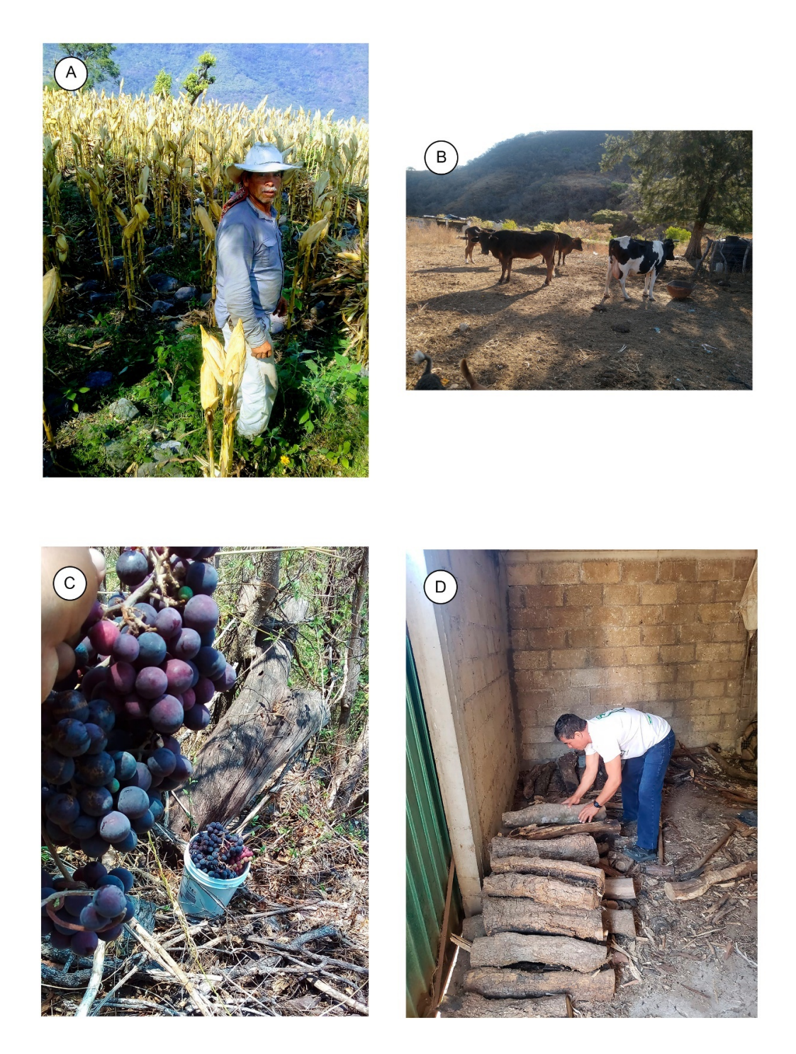
Figure 3. Main economic activities in "El Zapote" community - Central Mexico. A. Seasonal agriculture. B. Livestock farming. C. Harvest of "uva cimarron" ( Vitis tiliifolia Humb. & Bonpl. ex Roem. & Schult.) to the production of wine. D. Collection and storage of firewood.

some uses are more frequent than others. For example, people bring to their households plants to make handicrafts or a wood tool only occasionally, but several days a week they bring firewood. Thus, some species may rank higher than others when calculating