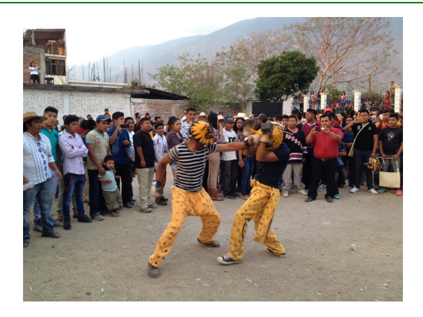
Figura 2. Ritual fight to propitiate rain.