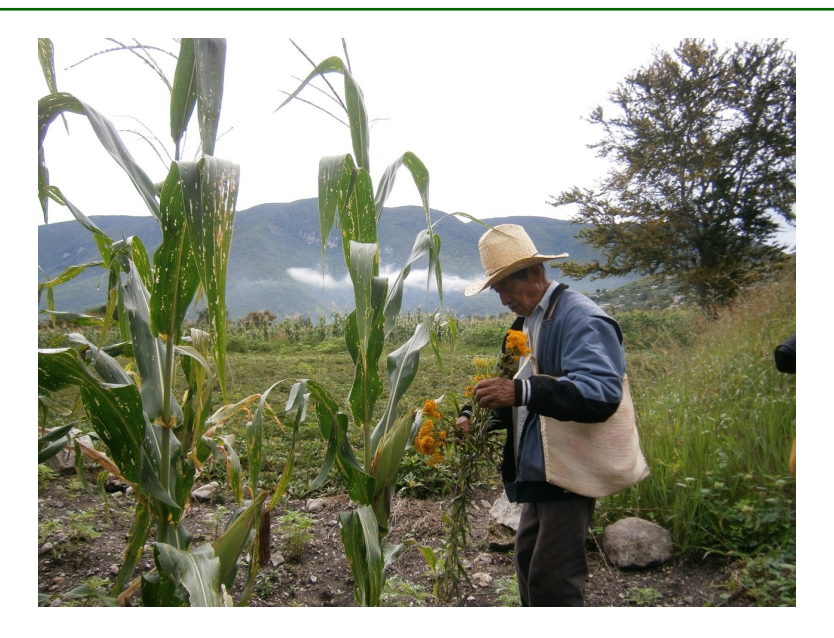
Figura 3. Offering in the milpa on the eve of Xilocruz.

It is worth noting that in the Mesoamerican world, the dead inhabited the same place as rain and seeds. An association that prevails between different peoples of Mesoamerican tradition (López Austin 2000). These festivities also show the relationship between the living and the dead in Acatlán, in which the dead do not inhabit a marginal place but actively participate in the community's life. So that they also work. For this reason, the community recognizes the dead's role in providing rain and food. A vision shared by other Nahua communities in Guerrero (Good 1996, 2004).