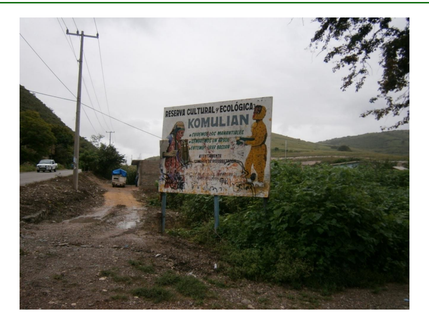
Figura 4. Community conservation area.

ple prayed for the end of the rain, but it did not stop. Hence, they concluded that maybe their behavior had been the cause of the disaster.